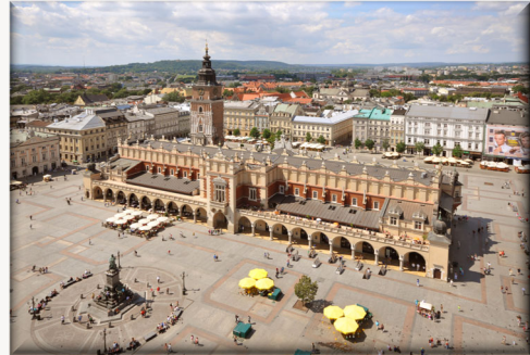
"LIVING KRAKOW - POLAND PILGRIMAGES SINCE 2005"