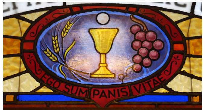
Saint Joseph's Catholic Church Central City, Kentucky

Healing grace, take my pain, guard me night and day. Shower me, with Your love, wash my tears away.