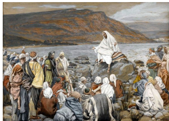
Jesus Teaches the People by the Sea (Jésus enseigne le peuple près de la mer) James Tissot, Brooklyn Museum

Oh, Pearl of greatest price, No act of sacrifice Can match the gift of life, I find within Your gaze Oh, what a sweet exchange, I die to rise again Lifted up from the grave, into Your hands of grace