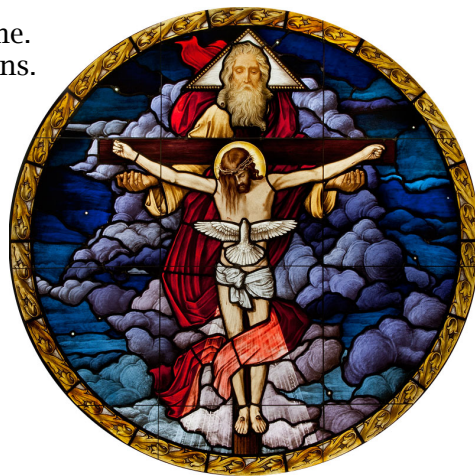
St. Anne's Catholic Church, San Diego, CA

We're singing for the glory of the risen King.