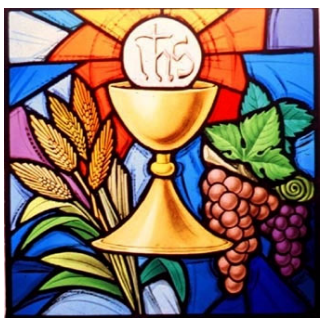
Christ the King Church Courtenay, BC, CAN

Wheat and grape incarnate a mystery; Jesus is the true living bread Let us eat with joy and thanksgiving, trusting in the word he has said.