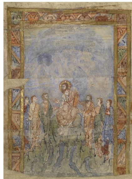
Christ Teaching, Unknown, Anglo-Saxon, about 1000, - Getty Museum

I live within You. Deep in Your heart, O Love. I live within You. Rest now in me.