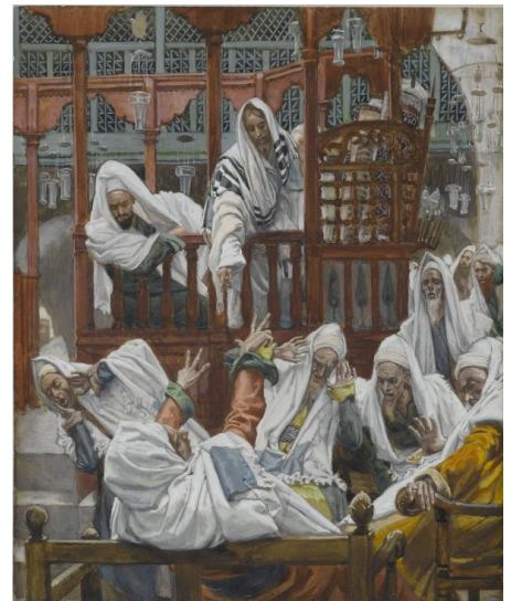
The Possessed Man in the Synagogue James Tissot, Brooklyn Museum

And You will come again in glory, to judge the living and the dead All eyes will look on Your glorious face, shining like the sun. Who is like You God?