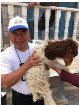
The shepherd and his lamb at the Shepherd's Fields

Moreover, thank you for your generous support to the Charity and Development Appeal and the ongoing Diocesan Campaign “Let us Go Forth...”, although we are re-drawing the plans of the diocesan campaign at the moment. I understand that you have been giving a lot; and God has been so generous by giving each of us the great opportunity to share our blessings for the good of others!