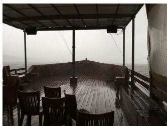
The seats at the front of the boat were vacated due to the hail storm.