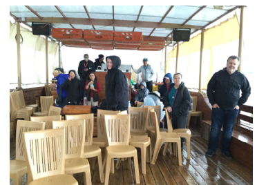
Peregrinos amontonados en la parte de atrás del bote debido a la tormenta