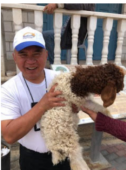
El pastor y su cordero en el campo de pastores

Además, quiero agradecerles por su generoso apoyo a la Campaña de Caridad y Desarrollo y la Campaña Diocesana en desarrollo “Vayamos Adelante...”, aunque por el momento estamos diseñando de nuevo los planes de la campaña diocesana. Entiendo que han estado dando mucho; ¡y Dios ha sido tan generoso al darnos a cada uno la gran oportunidad para compartir nuestras bendiciones para el bien de los demás!