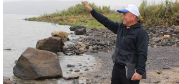
A la orilla del Mar de Galilea orando para calmar el mar