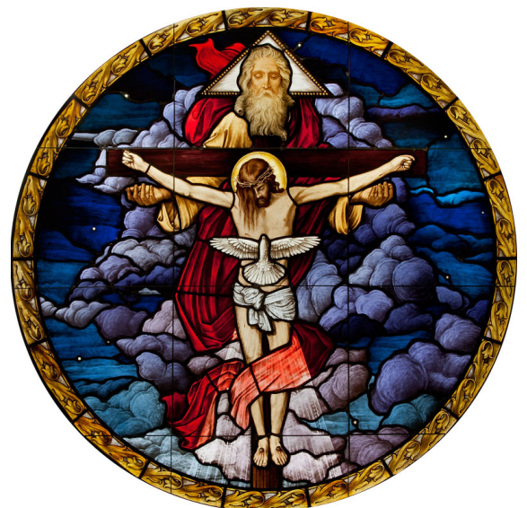
St. Anne's Catholic Church, San Diego, CA

Holy, Holy, Holy! Lord God Almighty! All thy works shall praise thy Name in earth and sky and sea; Holy, Holy, Holy! Merciful and mighty, God in three Persons, blessed Trinity.