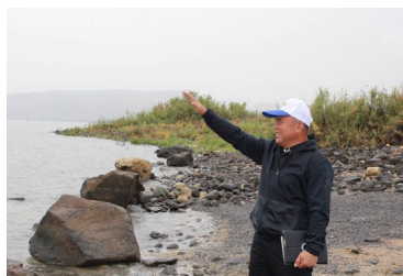
At the shore of the Sea of Galilee praying to calm the impending storm.