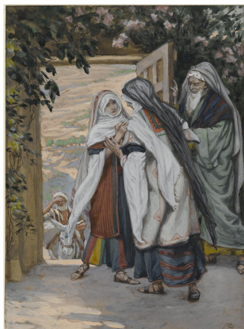
The Visitation, James Tissot Brooklyn Museum

When we hear the voice of God calling out our names, Lord we pray You give us faith to answer You in anything. And we may not understand the wisdom of Your plan, But we will answer: “Let it be. Let it be done unto me.”