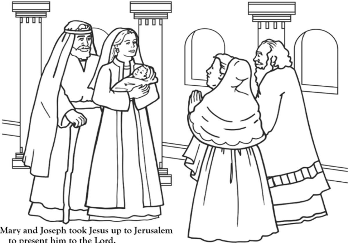
Mary and Joseph took Jesus up to Jerusalem to present him to the Lord.

After Mass please stay for a Catholic fair and refreshments served in the social hall!