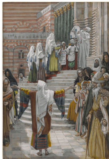
The Presentation of Jesus in the Temple James Tissot , Brooklyn Museum

For all those who live in the shadow of death, A glorious light has dawned. For all those who stumble in the darkness, Behold, your light has come.