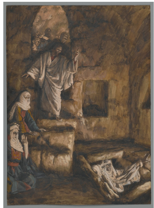
James Tissot, The Resurrection of Lazarus , Brooklyn Museum of Art

Fear not, I am with you; I am your God. I will strengthen you and help you; uphold you with my hand.