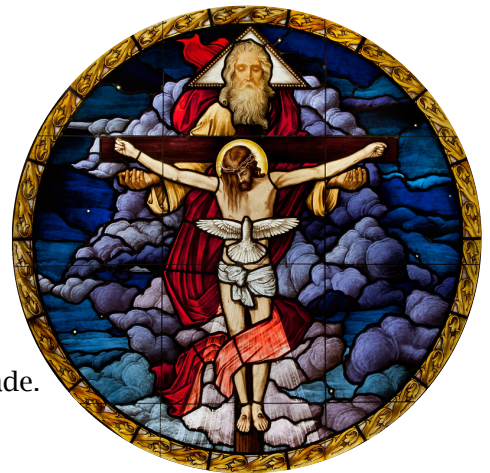
St. Anne's Catholic Church, San Diego, CA

We sing a myst'ry from the past, in halls where saints have trod, Yet ever near the music rings, to Jesus, Living Song of God.