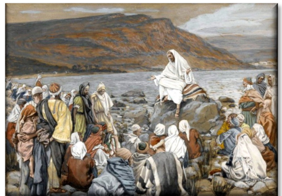
Jesus Teaches the People by the Sea (Jésus enseigne le peuple près de la mer) James Tissot, Brooklyn Museum

Oh, Pearl of greatest price, No act of sacrifice Can match the gift of life, I find within Your gaze Oh, what a sweet exchange, I die to rise again Lifted up from the grave, into Your hands of grace