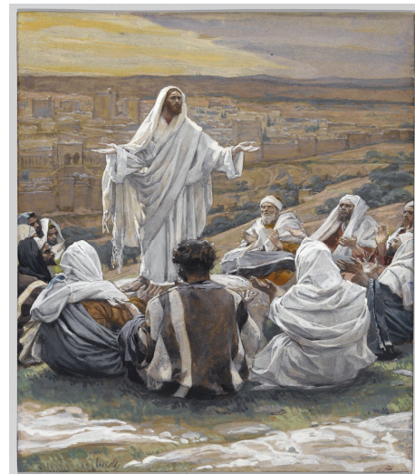
James Tissot, Le Pater Noster, Museo de Brooklyn

Vamos todos a la casa del Señor; Cantemosle con devocion. Vamos todos a la casa del Señor; Y entregale tu corazon.