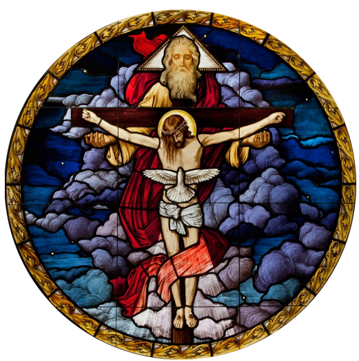
St. Anne's Catholic Church, San Diego, CA

Alleluia, alleluia! Glory be to God on high. Alleluia to the Savior who has won the victory.